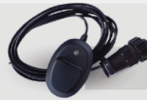
GM23: GPS L1 1 Hz *See catalogue GM23